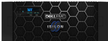
Dell EMC Isilon A200