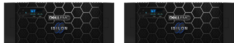
Dell EMC Isilon F800 Dell EMC Isilon F810

The hardware platforms allow you to consolidate and support a wide range of file workloads. With an ultra-dense, modular architecture that provides four nodes within a single 4U chassis, Isilon systems enables organizations to reduce data center space requirements and related costs by up to 75%. The platforms seamlessly integrate with existing clusters or can be deployed in new clusters.