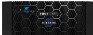
Dell EMC Isilon A2000