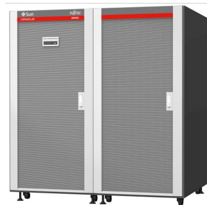
Base cabinet and Expansion cabinet

Its rich virtualization eco-system of extended partitioning and Solaris Containers coupled with dynamic reconfiguration, means non-stop operation and total resource utilization at no extra cost. Benchmark leading performance with the world's best applications and outstanding processor scalability just add to the capabilities of this most expandable of system platform.