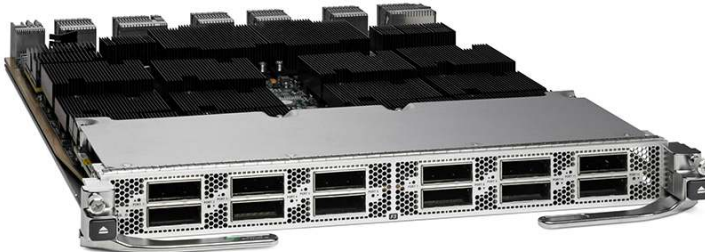
Table 1. Cisco Nexus 7700 Platform 100 Gigabit Ethernet Maximum Port Density