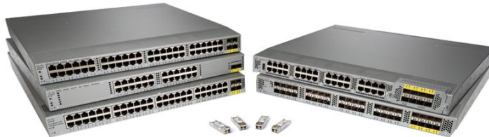
Figure 2. Cisco Nexus 2000 Series Fabric Extenders

The Cisco Nexus 2000 Series Fabric Extenders comprise a category of data center products that provide a server-access platform that scales across a multitude of 1 Gigabit Ethernet, 10 Gigabit Ethernet, unified fabric, rack, and blade server environments. The Cisco Nexus 2000 Series Fabric Extenders are designed to simplify data center architecture and operations by dramatically reducing the points of management and by meeting the business and application needs of a data center. Working in conjunction with Cisco Nexus switches, the Cisco Nexus 2000 Series Fabric Extenders offer a cost-effective and efficient way to support today’s Gigabit Ethernet environments while allowing easy migration to 10 Gigabit Ethernet, virtual machine-aware Cisco unified fabric technologies.