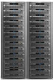
CLARiiON CX4 Model 480

Flexible, high-capacity networked storage—EMC CLARiiON CX4 model 480 supports up to 256 highly available, dual-connected hosts and has the capability to scale up to 480 disk drives for a maximum capacity of 471 TB. The CX4-480 supports Flash drives for maximum performance and CX4-480 customers can take advantage of EMC's unique data-in-place upgrade to the CX4-960.