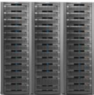
CLARiiON CX4 Model 960

Flexible, high-capacity networked storage—EMC CLARiiON CX4 model 480 supports up to 256 highly available, dual-connected hosts and has the capability to scale up to 480 disk drives for a maximum capacity of 471 TB. The CX4-480 supports Flash drives for maximum performance and CX4-480 customers can take advantage of EMC's unique data-in-place upgrade to the CX4-960.