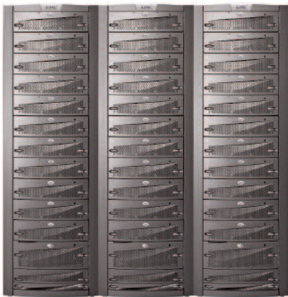
↑ CX3 model 80