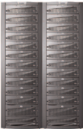
↑ CX3 model 40