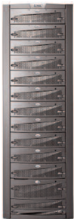
CX3 model 20

CLARiiON CX3 UltraScale series arrays are unique with their cost-effective data-in-place upgrade path to the higher models in the series. Just add the new software and swap storage processing enclosures and you're ready to go.