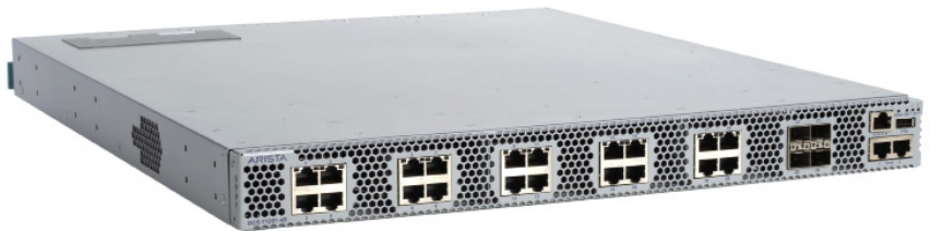
Arista 7120T-4S: 20-port 1/10GBASE-T (RJ-45) + 4 SFP+, 480 Gbps, 360 Mpps, L2/3/4