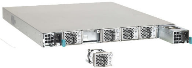
Arista 7100T rear view with two 1+1 redundant, hot-swappable power supplies and five N+1 redundant, hot-swappable independent fans.