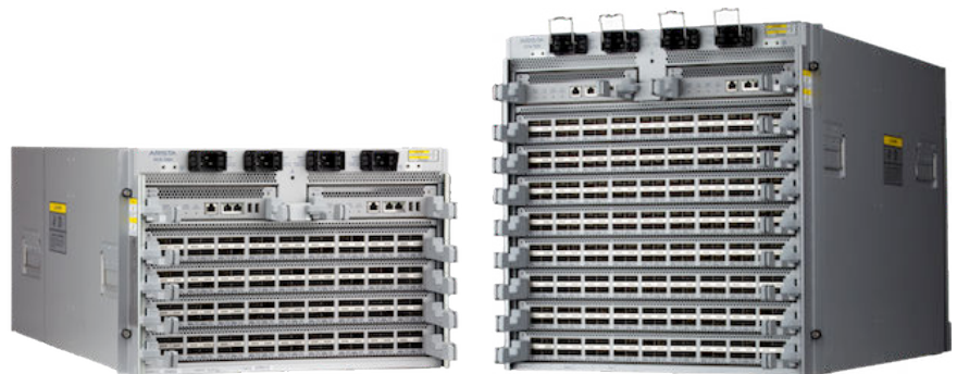
Arista 7500E Series Modular Data Center Switches

With front-to-rear airflow, redundant and hot swappable supervisor, power, fabric and cooling modules the system is purpose built for data centers. The 7500E Series is energy efficient with typical power consumption of under 4 watts per port for a fully loaded chassis. All of these attributes make the Arista 7500E an ideal platform for building reliable, low latency, resilient and highly scalable data center networks.