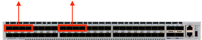
Arista 7150S AgilePorts - Four SFP+ grouped to deliver 40GbE