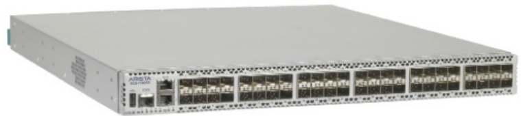
Arista 7148SX: 48-port 10GbE 960Gbps, 720Mpps, L2/3/4, 1U Switch (SFP+)

The Arista 7148S and 7148SX switches are high performance, ultra-low latency layer 2/3/4 10 Gigabit Ethernet data center switches. Offered with 48 1/10GbE ports in a compact 1RU chassis with redundant power and cooling, the Arista 7148S/SX switches feature front-to-rear airflow when mounted in either direction for flexible top of rack server aggregation deployments. All ports accommodate the full range of 10GbE SFP+ or GbE SFP optical or copper physical layer options, allowing for maximum flexibility and investment protection as customers of all sizes migrate server connections from Gigabit to 10 Gigabit Ethernet.