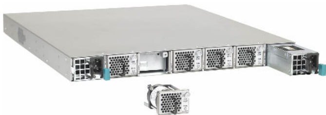
Arista 7148S/7148SX rear view with two 1+1 redundant, hot-swappable power supplies and 5 N+1 redundant, hot-swappable independent fans.