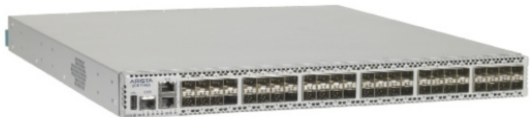
Arista 7148S: 48-port 10GbE 800Gbps, 600Mpps, L2/3/4, 1U Switch (SFP+)