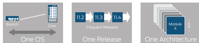
Figure 2: Junos OS utilizes a single source code, adheres to a consistent and predictable release train, and employs a single modular architecture.

These attributes are fundamental to the core value of the software, enabling all products powered by the Junos OS—routers and switches—to be updated simultaneously with the same software release. All features, new and old, are fully regression-tested, making each new release a true superset of the previous version. Customers can deploy a new Junos OS release with complete confidence that all existing capabilities will operate in the same way and be compatible on all Juniper Networks switches and routers in the network.