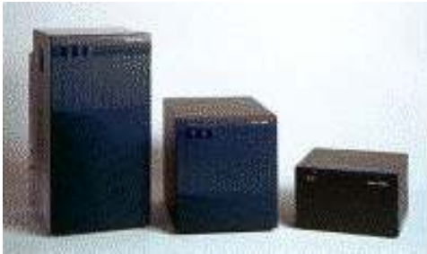
Figure 1. Cisco 7500 Series Router

The Cisco ® 7500 Series router is the premier Cisco distributed services, multiprotocol platform, now with twice the performance and enhanced high-availability (HA) features. The Cisco 7500 Series combines proven Cisco software technology with exceptional reliability, availability, serviceability, and performance features to meet the requirements of today's most mission-critical networks. The Cisco 7500 Series router provides service provider and enterprise networks with the flexibility they need to meet the constantly changing requirements of their networks. The three models of the Cisco 7500 Series allow users to choose the exact configuration needed to optimize installations and network designs for cost and functionality.