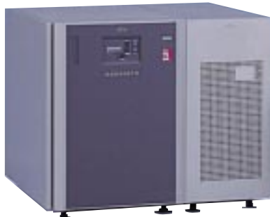
Disk Mounted Model (desk-side type)