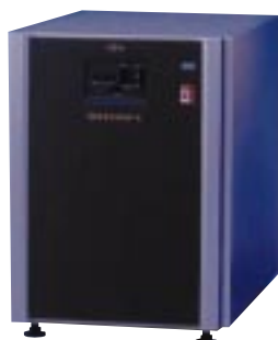
Standard Model (desk-side type)

Mounting a special crypto coprocessor makes possible high-speed processing while maintaining tamper-proof data secrecy during network computing.