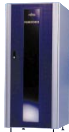
Special 19-inch rack