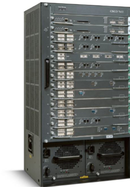
Cisco 7613 Chassis

The Cisco 7613 delivers 13 slots of optical LAN, WAN, and MAN networking at the network edge, which enables service providers to offer high-value, differentiated services and provides enterprises the ability to deploy the advanced network infrastructure necessary to succeed in demanding high-traffic environments.